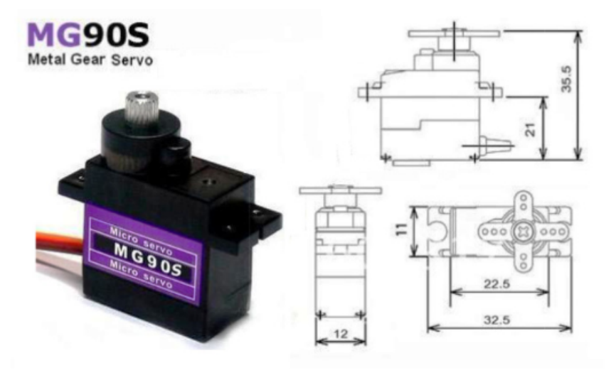
MG90S servo, Metal gear with one bearing

Tiny and lightweight with high output power, this tiny servo is perfect for RC Airplane, Helicopter, Quadcopter or Robot. This servo has metal gears for added strength and durability.