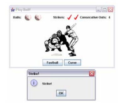
Figure 1: The Baseball Game Task.