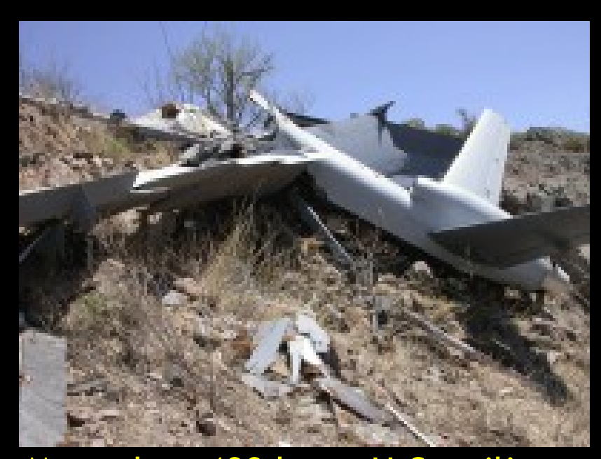
More than 400 large U.S. military drones have crashed in major accidents around the world since 2001, a record of calamity [...], according to a year-long Washington Post investigation.